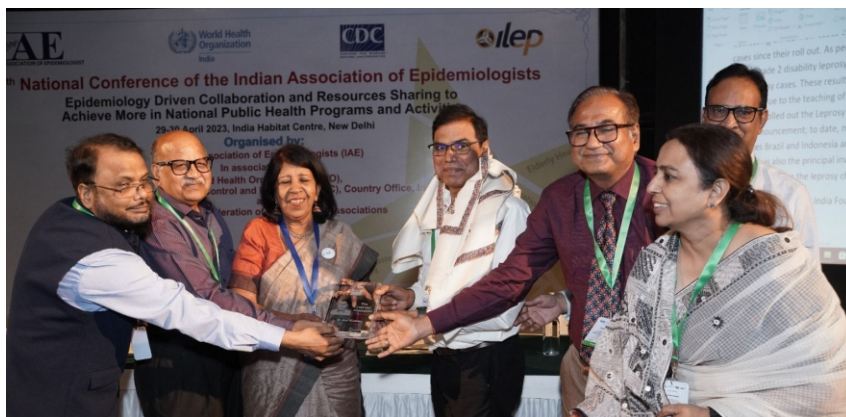
13th National Conference of Indian Association of Epidemiologists (IAE) organised on 29th & 30th April 2023 at India Habitat Centre, New Delhi.